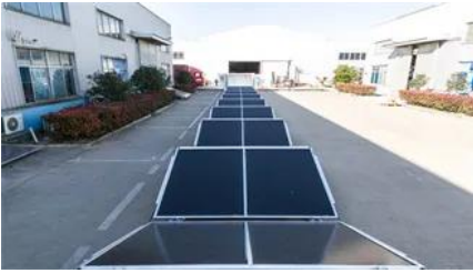
Mobile Solar Container Systems , Foldable PV Panels

LZY Mobile Solar Container System - The rapid-deployment solar solution with 20-200kWp foldable PV panels and 100-500kWh battery storage. Set up in under 3