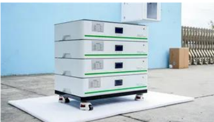
Egs Smart Energy Storage Cabinet , ESAFETY SOLAR CONTAINER

This outdoor 19-inch battery cabinet is engineered for telecom base stations, solar energy storage systems, and various outdoor power applications. Constructed from high-strength steel or stainless