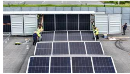
Off grid Hybrid 1.5kw-5kw high frequency solar inverter

FEATURES off grid hybrid type. 120V-500V wide PV input. Working without battery is acceptable. Smart wifi or 4G remote monitoring optional. Output power