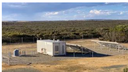
Infrastone : BLACK-STONE NETWORK : Blackstone Outdoor Racks :

Blackstone Outdoor 6U 600mm Depth Wall-Mount Networking Cabinet provides weatherproof, secure storage for IT and telecom equipment, designed for reliable outdoor use.