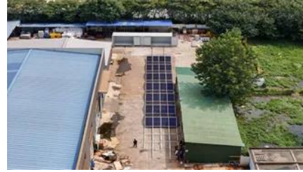
200kW Photovoltaic Energy Storage Container for Port Terminals

Decide whether to include solar + storage projects in a procurement based on storage benefits for addressing energy cost savings and/or resilience use cases at specific sites.