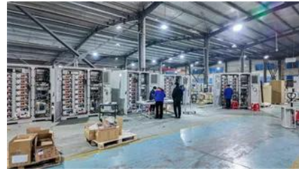
Niue EK solar container outdoor power 1 kWh , PABIANICE BESS

This article ranks the top solar installers in Niue, explores industry trends, and highlights what makes EK SOLAR a trusted partner for both residential and commercial projects.